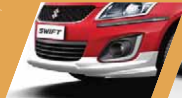
FRONT UNDERBODY SPOILER

IT'S TIME TO CREATE YOUR SWIFT WITH A DYNAMIC RANGE OF ROOF WRAPS, HOOD STRIPES, EXTERIOR STYLING KIT, INTERIOR FLOCKING KIT AND MUCH MORE.