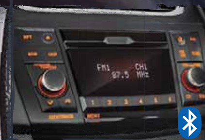
AUDIO SYSTEM WITH BLUETOOTH