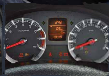
INSTRUMENT PANEL WITH MULTI-INFORMATION DISPLAY