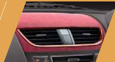
INTERIOR FLOCKING KIT COLOUR OPTIONS

COLOUR OPTIONS EXTERIOR STYLING KIT FIRE RED GRANITE GREY SILKY SILVER GLISTERING GREY PEARL ARCTIC WHITE