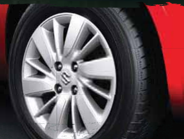
185/65 R15 ALLOY WHEELS