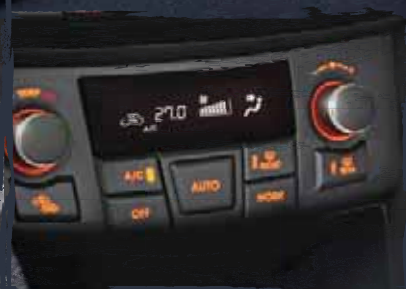
AUTOMATIC CLIMATE CONTROL