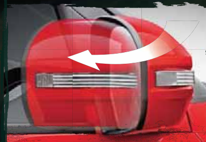
ELECTRONICALLY RETRACTABLE ORVM WITH TURN INDICATORS