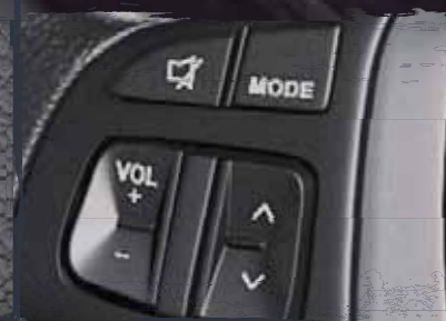
STEERING-MOUNTED AUDIO CONTROLS