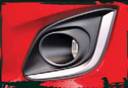
FOG LAMP BEZEL (SILVER ACCENT)