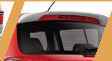
REAR UPPER SPOILER