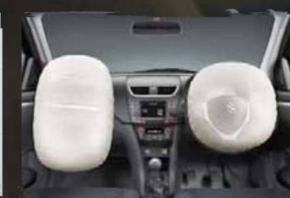
DUAL SRS AIR BAGS