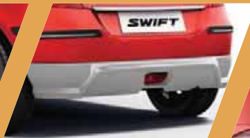
REAR UNDERBODY SPOILER