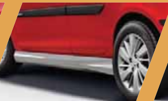
SIDE UNDERBODY SPOILER