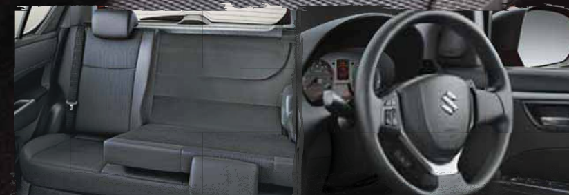
60:40 SPLIT SEATS